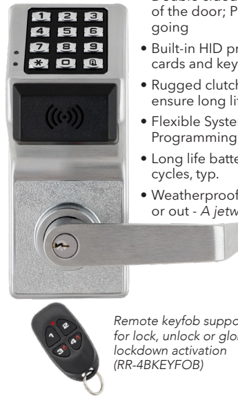
Remote keyfob support for lock, unlock or global lockdown activation (RR-4BKEYFOB)