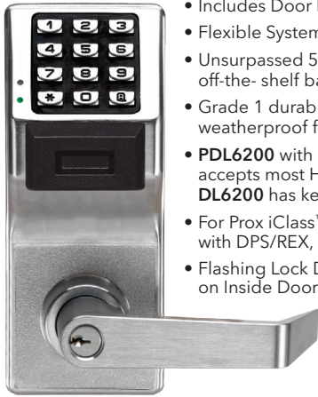
Lockdown indicator on back