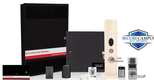
NAPCO Access Pro, Continental, Networkx & ArchiTech are trademarks of NAPCO. All others are trademarks of their respective companies. A830 6.2023

Get Expert Advice from a Certified Napco Access Pro Dealer: