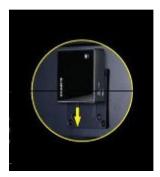
Flexible mounting options

For more information, please contact your local sales representative or contact Continental Access directly at (631) 842-9400.